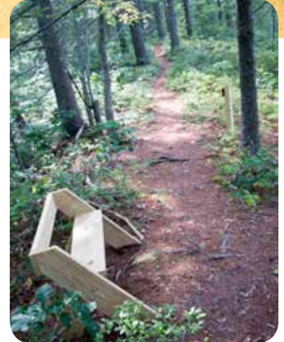
Stop #5: ridge is an example of glacial esker