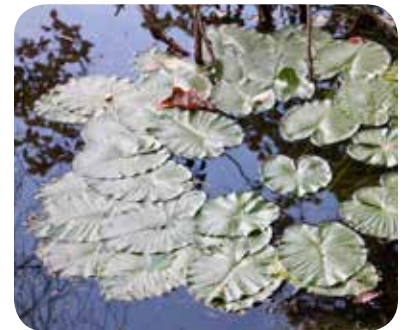
Between Stops #2 & 3: example of unique vegetation found on kettle ponds