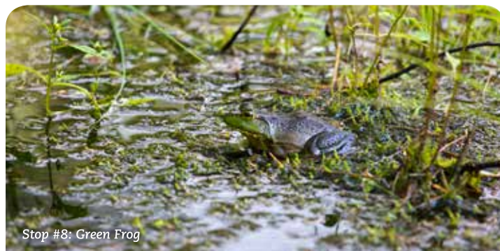
Stop #8: Green Frog

12. Besides walking and nature observation, Hogback Trail provides excellent fishing access. The cold clear waters provide a good trout fishery and are suitable for shore bank fishing or small hand-carried boats.