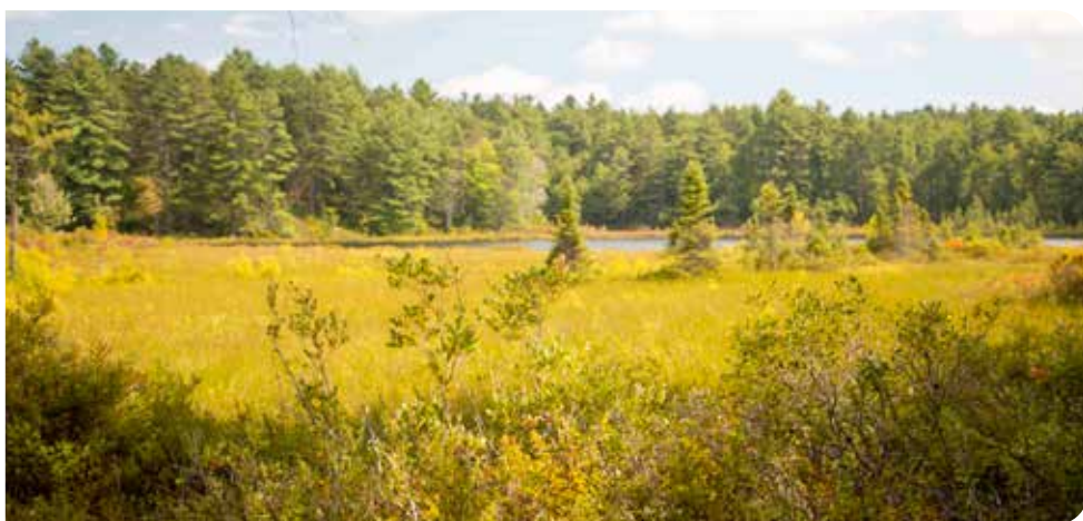
Stop #10: Black Spruce trees & small shrubs growing on Sphagnum Moss