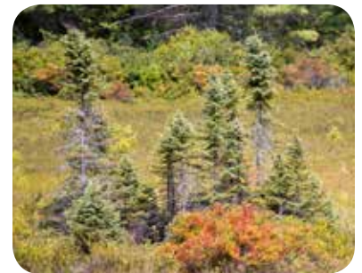
Stop #10: Black Spruce trees and small shrubs growing on Sphagnum Moss