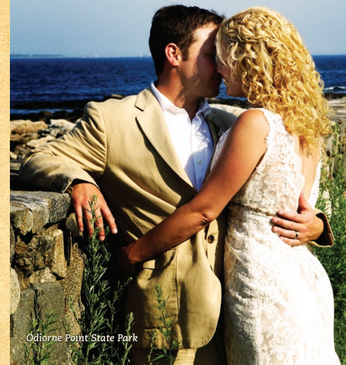
Odiorne Point State Park